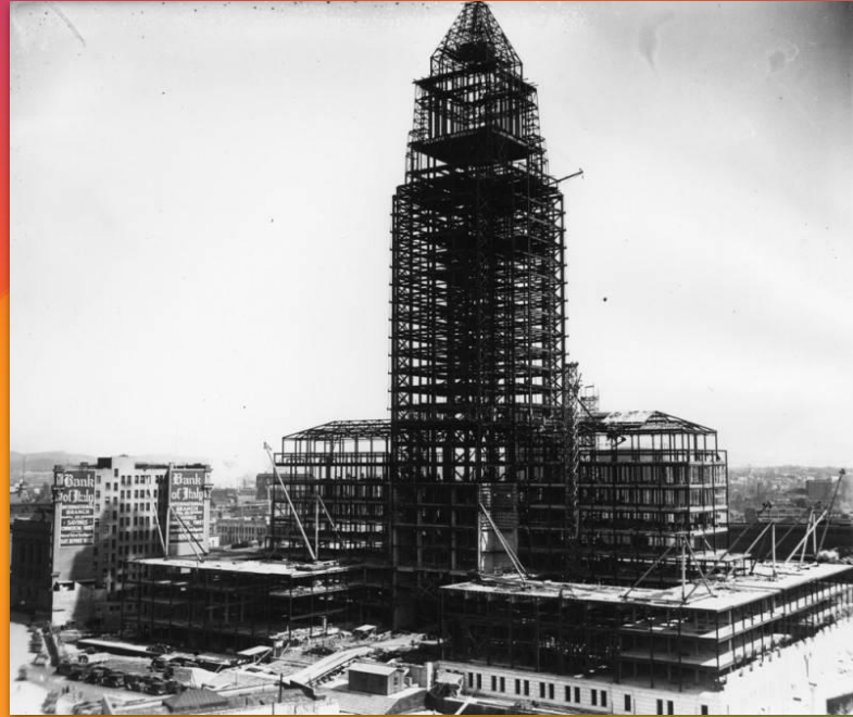
Construction of LA city hall, 1927